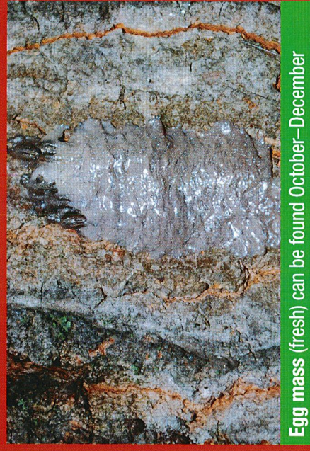
Egg mass (fresh) can be found October–December