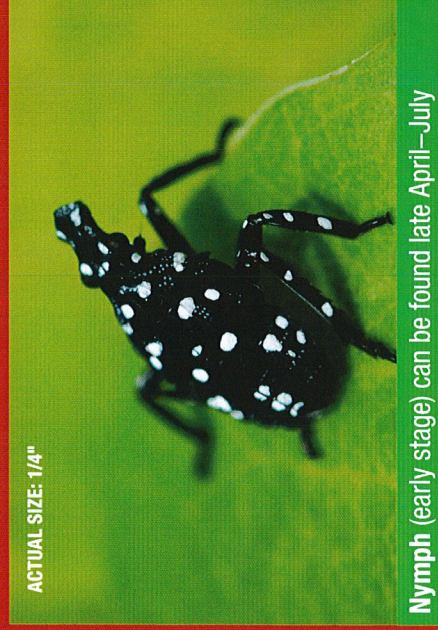
ACTUAL SIZE: 1/4" Nymph (early stage) can be found late April–July