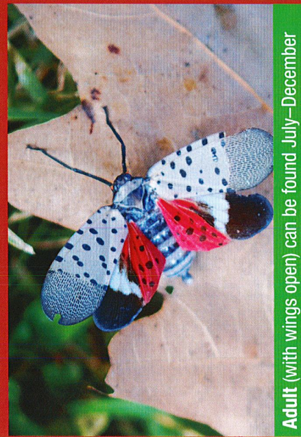
ACTUAL SIZE: 1" Adult (with wings open) can be found July–December