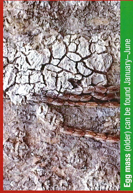
Egg mass (older) can be found January–June

THIS INVASIVE INSECT POSES A SIGNIFICANT THREAT to Pennsylvania agriculture, including the grape, tree fruit, hardwood, and nursery industries, which are collectively worth nearly $18 billion to the state's economy.