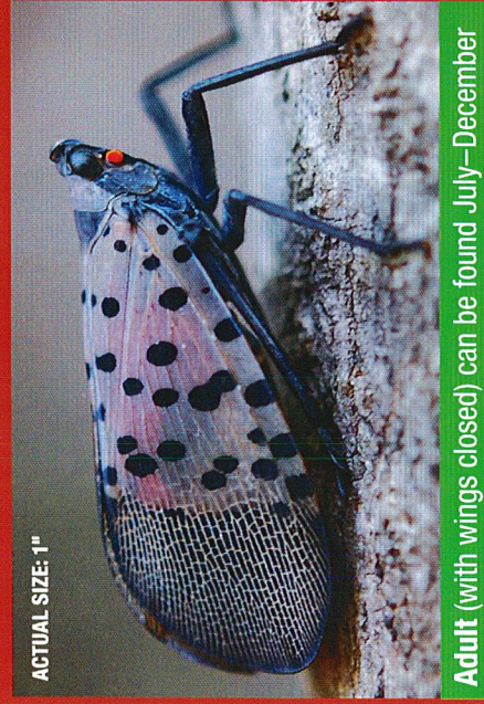
ACTUAL SIZE: 1" Adult (with wings closed) can be found July–December